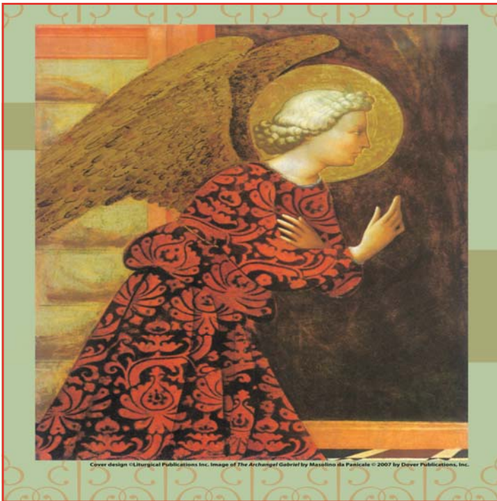
Cover design ©Liturgical Publications Inc. Image of The Archangel Gabriel by Massimiliano Pasticale © 2007 by Dover Publications, Inc.