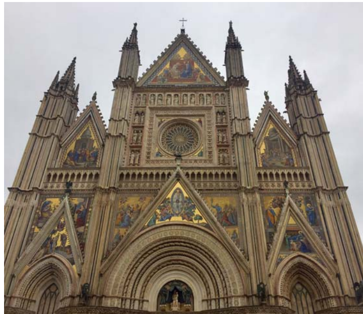
Orvieto Cathedral in Umbria, Italy