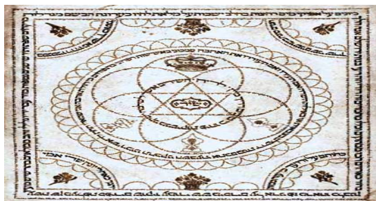
SONG -OF- SOLOMON