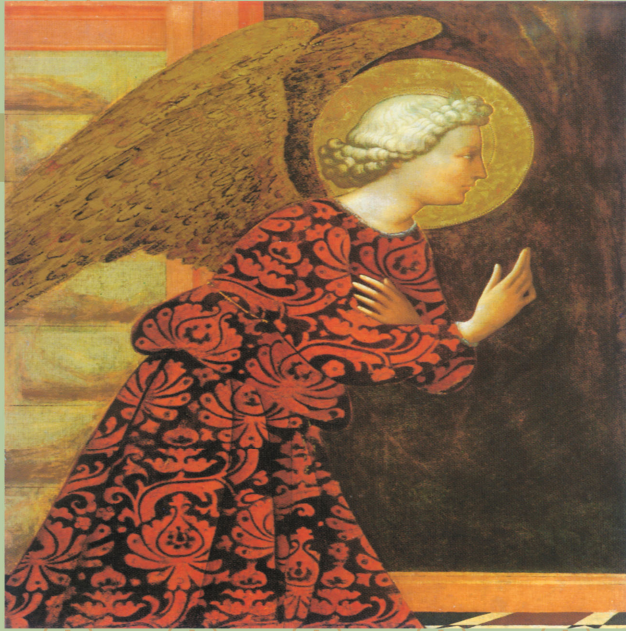
Cover design ©Liturgical Publications Inc. Image of The Archangel Gabriel by Masolino da Panicale