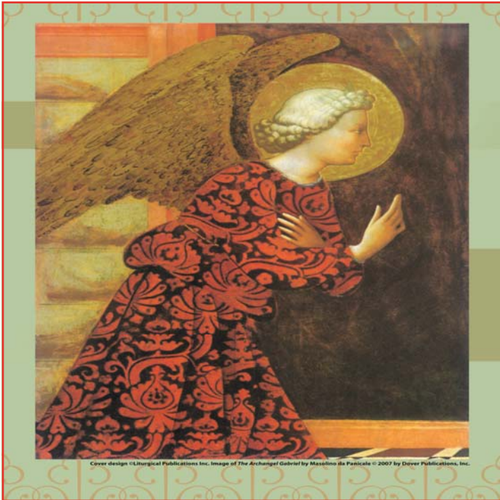
Cover design ©Liturgical Publications Inc. Image of The Archangel Gabriel by Massimo da Panicale © 2007 by Dover Publications, Inc.