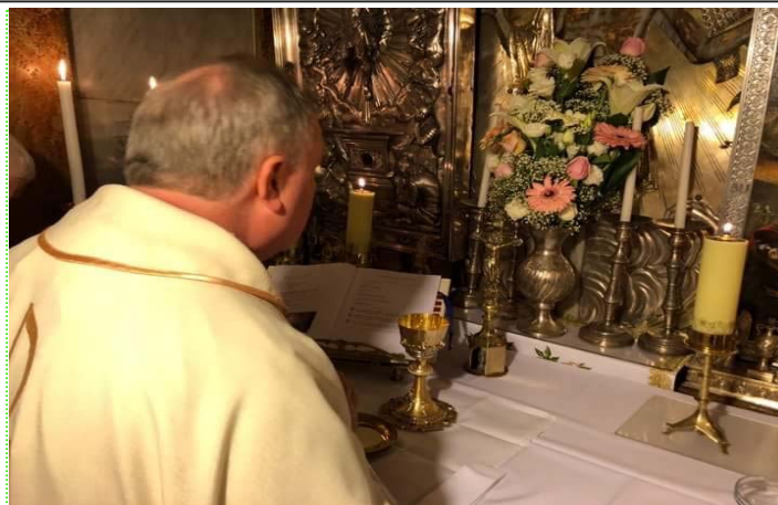
Mass in the Tomb of Christ