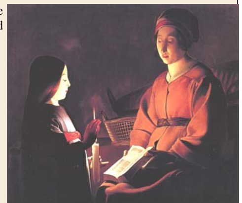
The Education of the Virgin-Georges de La Tour