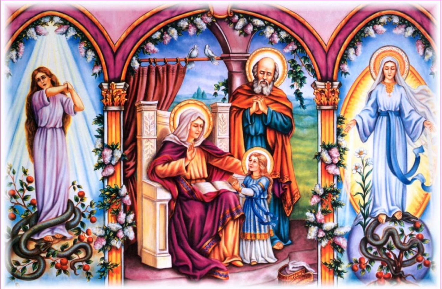
Saints Joachim and Anne