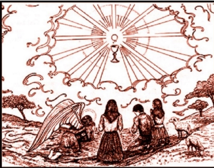
My God, I believe, I adore, I trust and I love You! I beg pardon for all those who do not believe, do not adore, do not trust and do not love You.