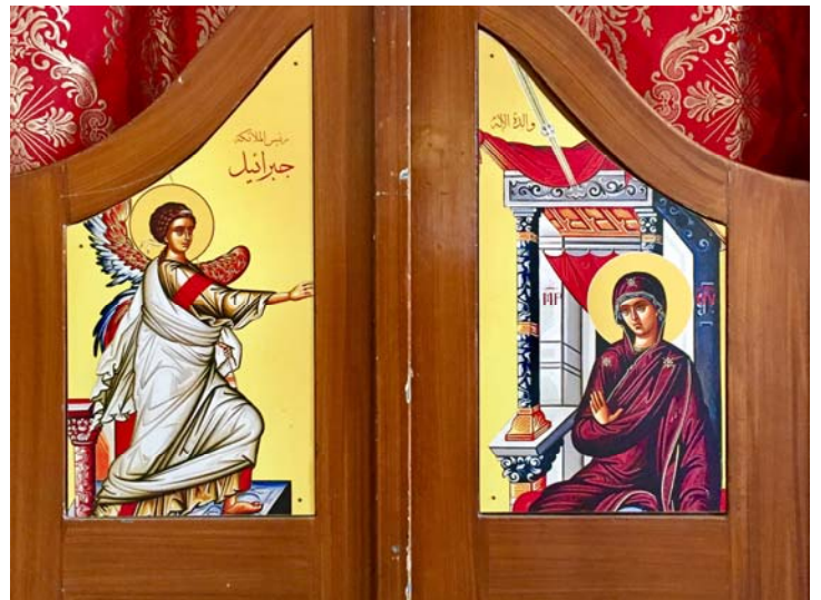
From the iconostasis-the screen made of icons which sets off the sanctuary in Eastern churches. It shows the Annunciation, and that's the Archangel Gabriel on the left.

These are easy to collect and save and its almost hard to believe the difference they can make in someone's life! Bring in a baggie full and leave in the container in the church lobby. Thank you!