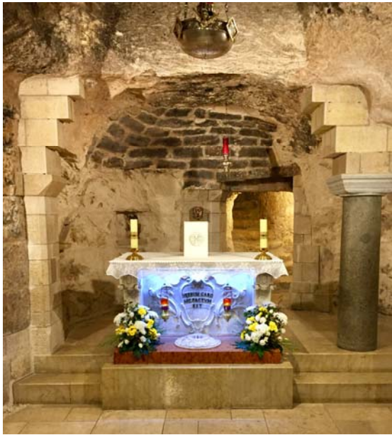
The Home of the Blessed Virgin Mary in Nazareth, where the Archangel Gabriel appeared to her.